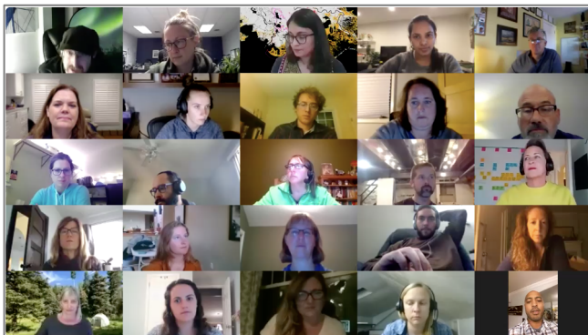
Participants from the Fall 2020 Evening Program