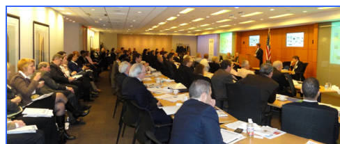
A panoramic photo of the workshop's 105 attendees listening to USGBC's Jason Hartke.