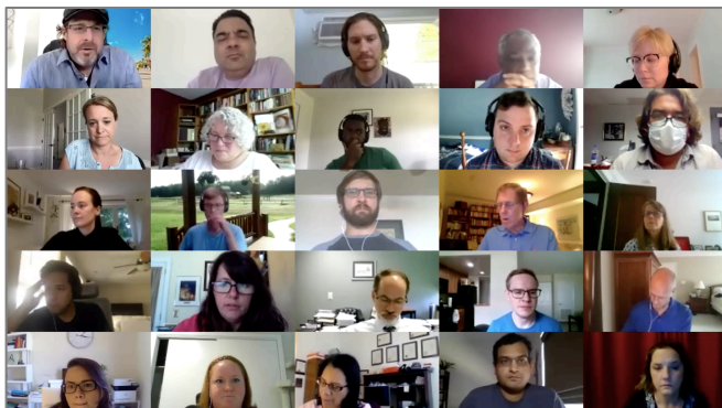
Participants from the Summer 2020 Daytime Program